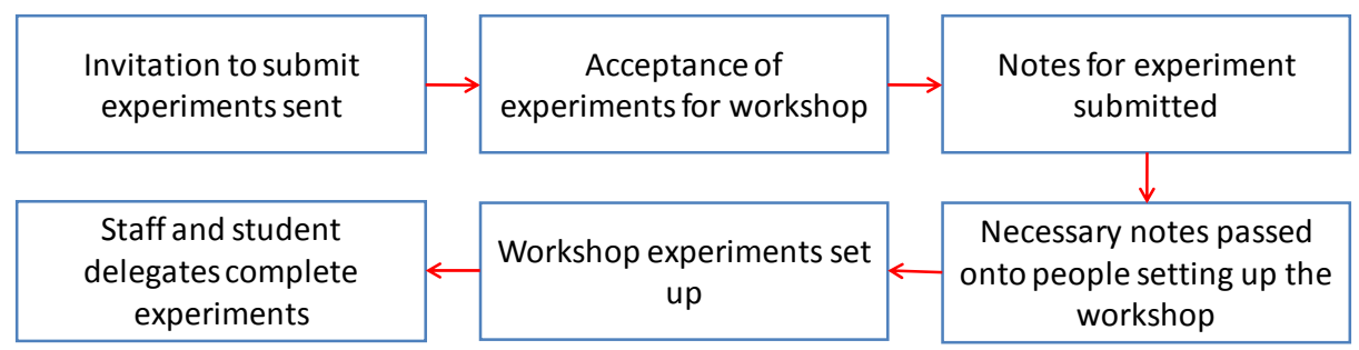
Figure 2: The process undertaken to set up the ASELL Science Workshop held at the University of Adelaide

The technical notes, experiment notes and risk assessments were passed onto the technical staff and PhD students who were employed to set up the workshop. Using the notes provided the experiments for the chemistry and biology workshops were set up in the corresponding laboratories at the University of Adelaide (setup commenced about 2 weeks before the workshop). Academics that submitted physics experiments were asked to send or bring their own equipment, except for common equipment provided on a list by the host institution. Equipment for biology and chemistry activities was provided by the host institution. Not all the experimental activities were easy to set up and some experiments required assistance from other disciplines. For example, two biochemistry experiments that were run at the chemistry workshop required equipment that was provided from biology. If there were any materials that could not be provided by the host institution, the submitters were asked to either send these beforehand or bring it with them (this was kept to a minimum). Fortunately, in most cases, enough laboratory space was available for the majority of experiments to be set up the day before they were due to be run. The PhD students who set up the experiments acted as technical staff throughout the workshop.